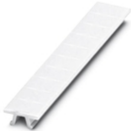
Zack marker strip, 10-section, horizontally labeled with the consecutive numbers: 31 ... 40, white, width: 6 mm

Please be informed that the data shown in this PDF Document is generated from our Online Catalog. Please find the complete data in the user's documentation. Our General Terms of Use for Downloads are valid ( http://phoenixcontact.com/download )